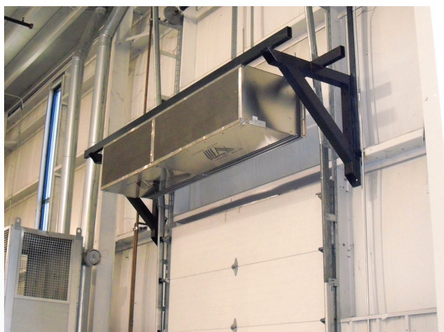
Model BPA | Brackets with Strut