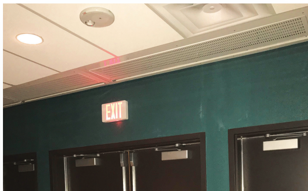
Model CHD | Doors to parking garage